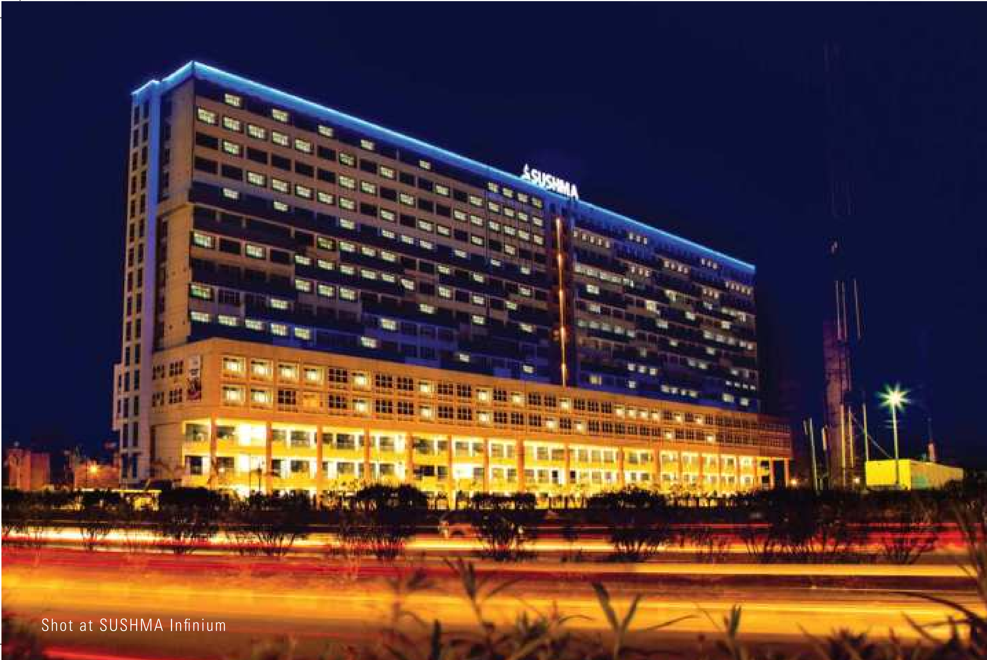
Shot at SUSHMA Infinium